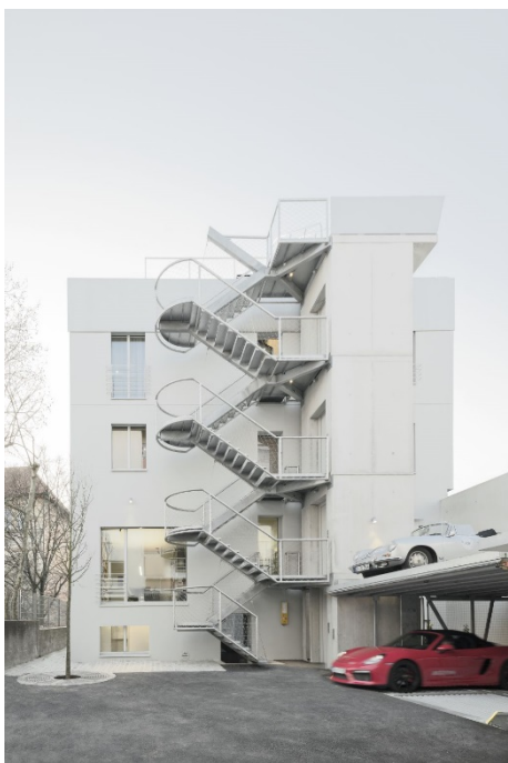
Figure 1: The number of parking spaces is doubled. On an area of only two parking spaces, there is room for four cars. This creates more free space for playing and exploring.