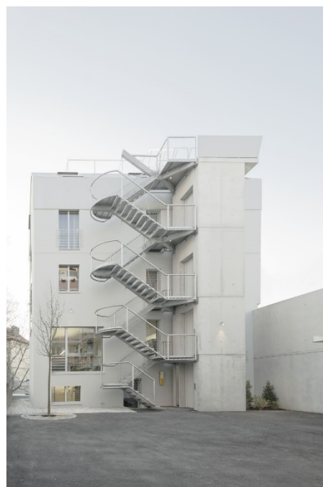
Figure 2: In the lowered position, the Parking lift 461 and the parked cars are invisibly concealed. The upper platform closes flush with the floor and has the same cover as the remaining inner courtyard.