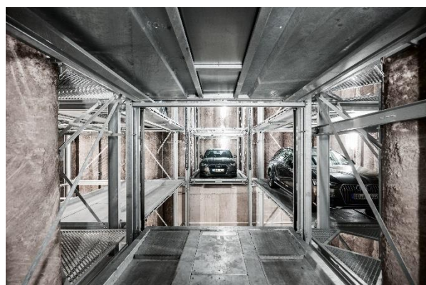
Image 3 and 4: The platform is automatically lowered from the transfer cabin with the vehicle and stored into the vacant shelf space.