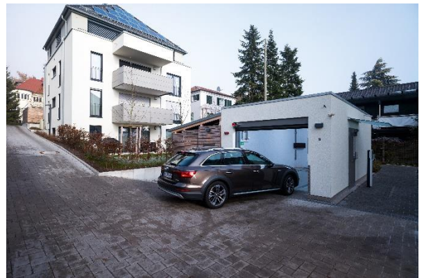
Image 1 + 2: Optionally, the transfer cabin can also be designed as a fixed garage. Such as here in a project in Korntal near Stuttgart.