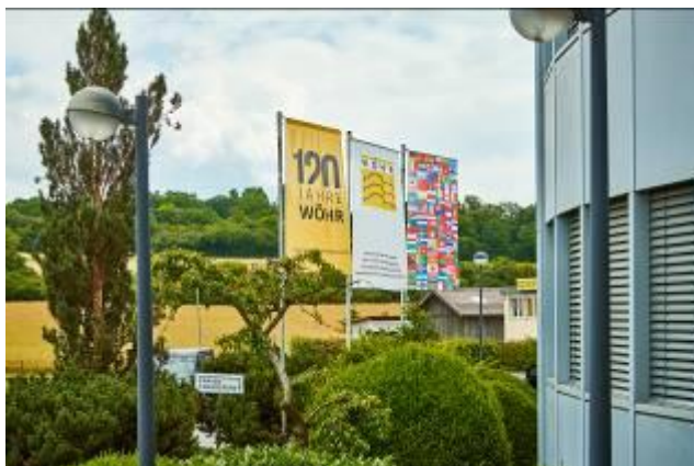
International Sales Meeting in Frielzheim in June 2022

The sales network extends across 70 countries: on the occasion of the anniversary, more than 80 sales partners came to the International Sales Meeting in Frielzheim from 28 to 30 June 2022. Among other things, the new products of the Combilift and Combiparker family were presented during lectures and workshops. During a tour of the sales and production hall as well as numerous workshops and evening events, there was also ample opportunity for the partner countries to exchange experiences.