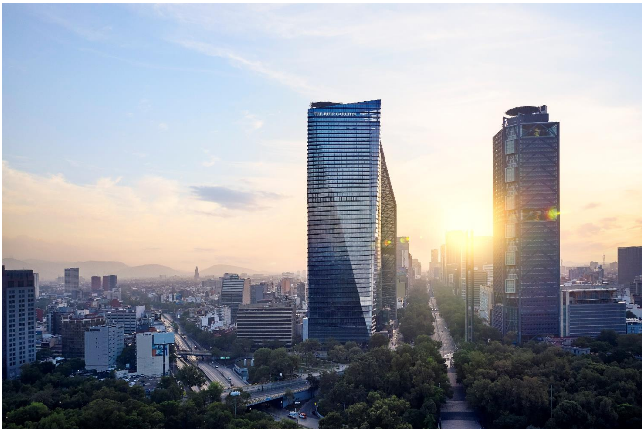
The new Chapultepec Uno tower houses offices, flats and rooms of the upmarket hotel brand Ritz Carlton

underground levels, each of which can accommodate 80 vehicles. There is no fixed arrangement of spaces - the system assigns the vehicles to the different levels and parking spaces according to availability: This constant dynamic guarantees optimal utilisation of the system.