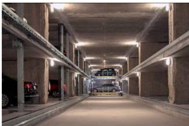
Chapultepec offers a lot of space in a small area.