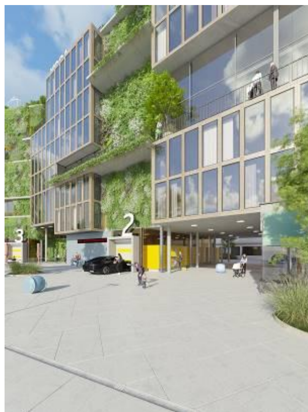
Automatic parking system in the neighbourhood centre.