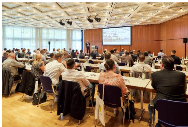
Sales partners from a total of 34 countries, as well as employees, use the meeting to network and exchange new ideas and experiences