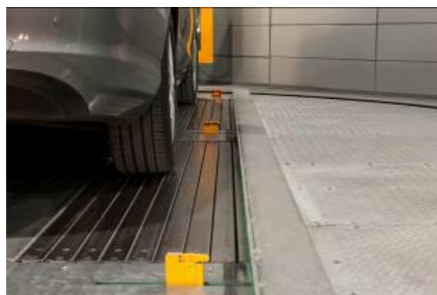
Lateral sensors are located in the transfer areas. sensors.